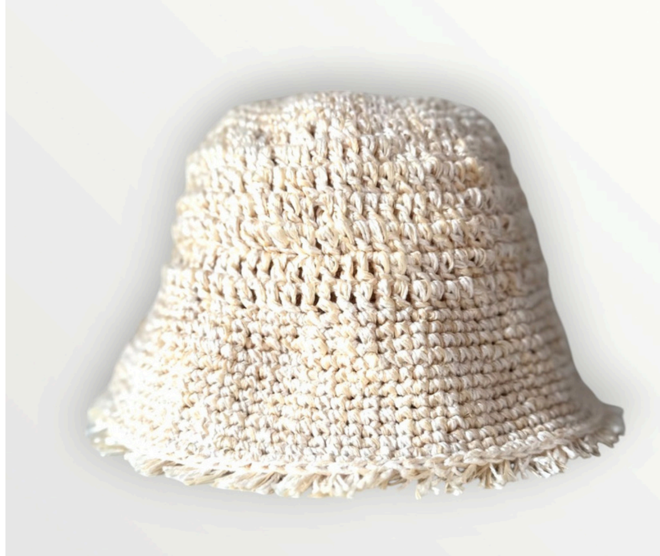
Traditional Crochet Hat in Sustainable Brazilian Silk.